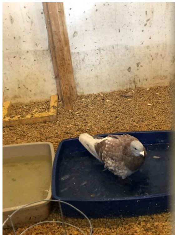
Right: “Walter Pigeon” enjoying a bath in my coop